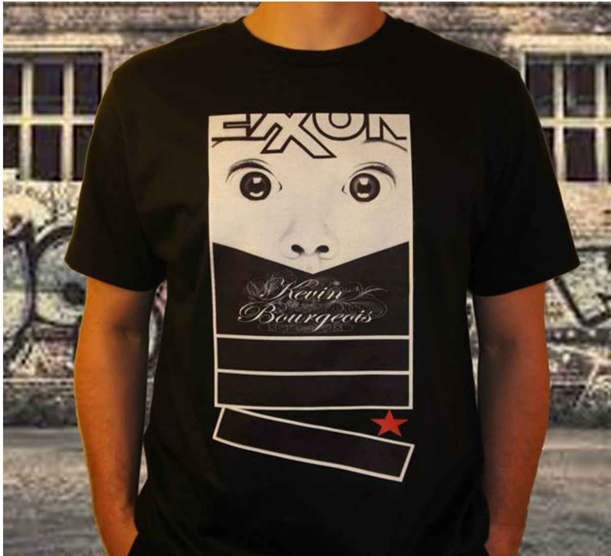
Kevin Bourgeois Tee